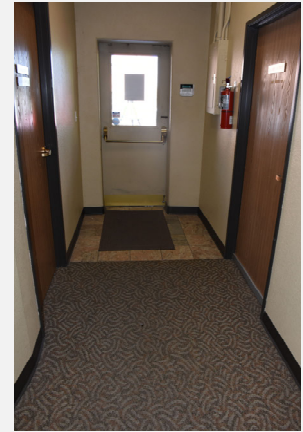
East door with end of curved wall on the left.