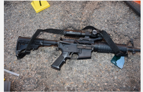
Troyke’s rifle seized from where Hurley fell.

Hall entered an office on the south side of the building and told the woman inside that there was an active shooter, and she hid. While at the window Hall heard a third round of shots and prepared to engage the man in black through the window, but he never came into sight. Meanwhile, Boom found the west side door locked on the inside. Through the glass, Boom could see people running west in a panic, away from the square. Unable to exit through the west door, Boom decided to return to the east door.