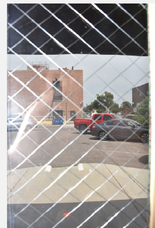
East door window close-up.